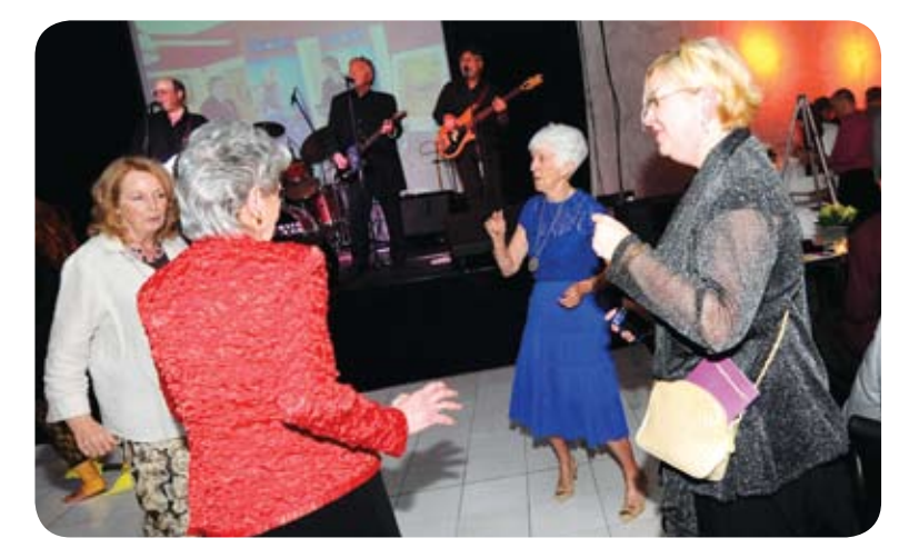
The music worked its magic and the dance floor saw action